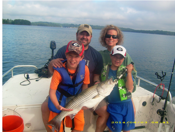
"Big Fish On" Lake Lanier Fishing Charters and Guide