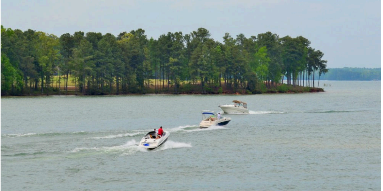
Boats on Lake Lanier