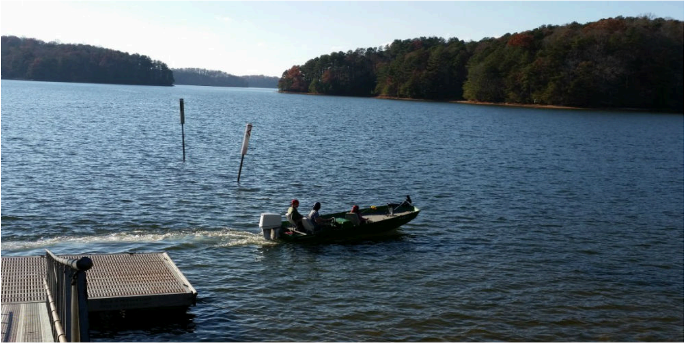
Fishing on Lake Lanier