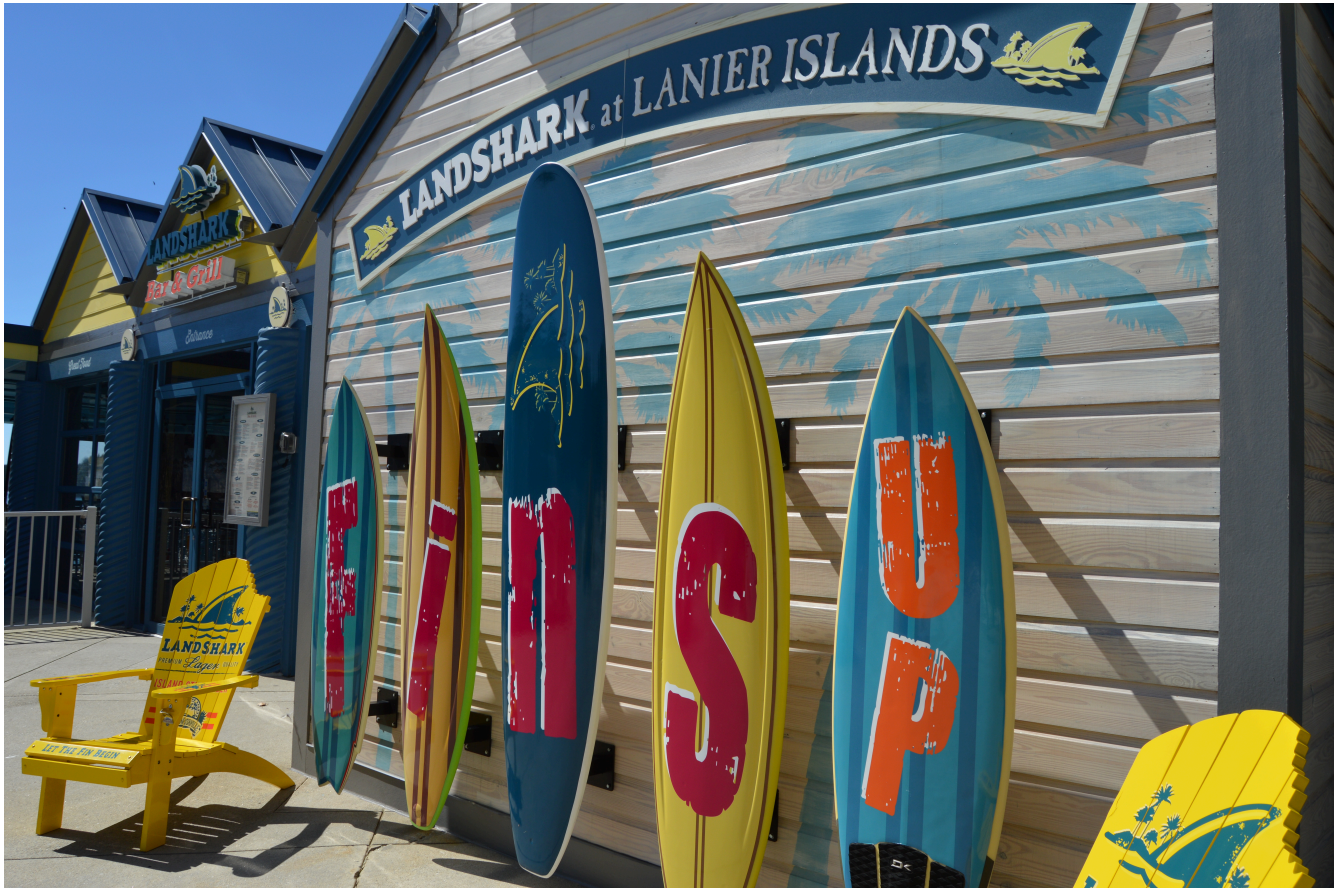
LandShark Bar and Grill