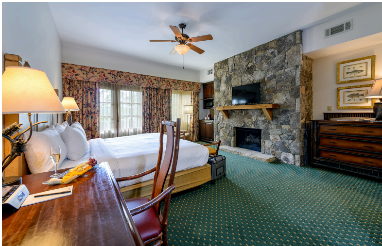
Legacy-Villas-King Suite