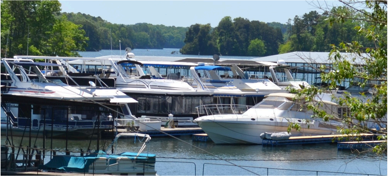
Lake Lanier Marinas