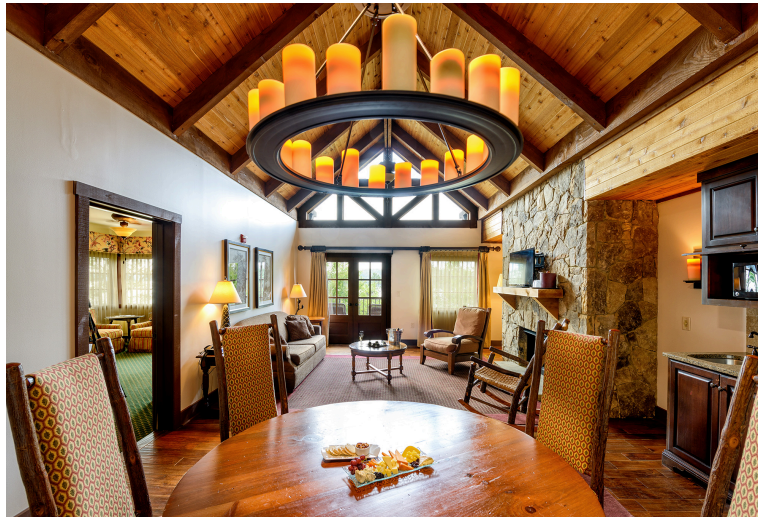
Legacy-Villas-Living Room, photograph from Lanier Islands

each LakeHouse. The LakeHouses at Legacy are pet-friendly. Find out more about LakeHouses at Legacy: http://www.lanierislands.com/accommodations/lakehouses .