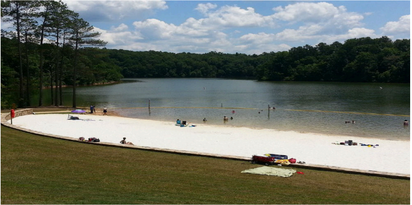
Designated Swim Area at Don Carter State Park