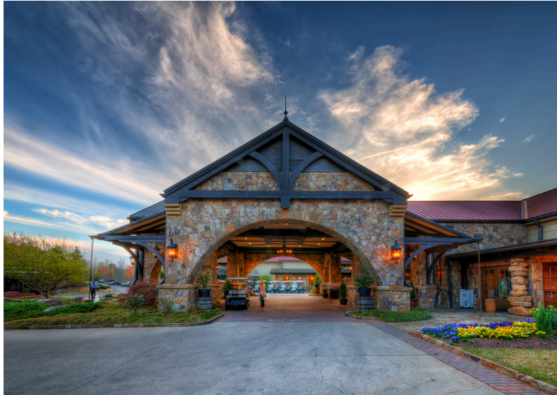
Legacy Lodge Front Entrance, photograph from Lanier Islands