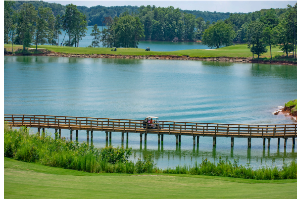
Legacy Golf Course Lake Lanier