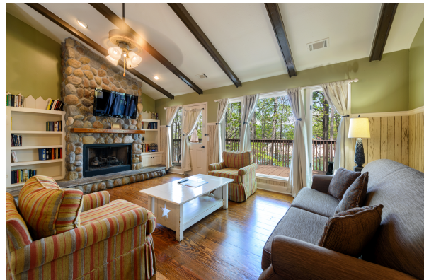
Legacy LakeHouses

each LakeHouse. The LakeHouses at Legacy are pet-friendly. Find out more about LakeHouses at Legacy: http://www.lanierislands.com/accommodations/lakehouses .