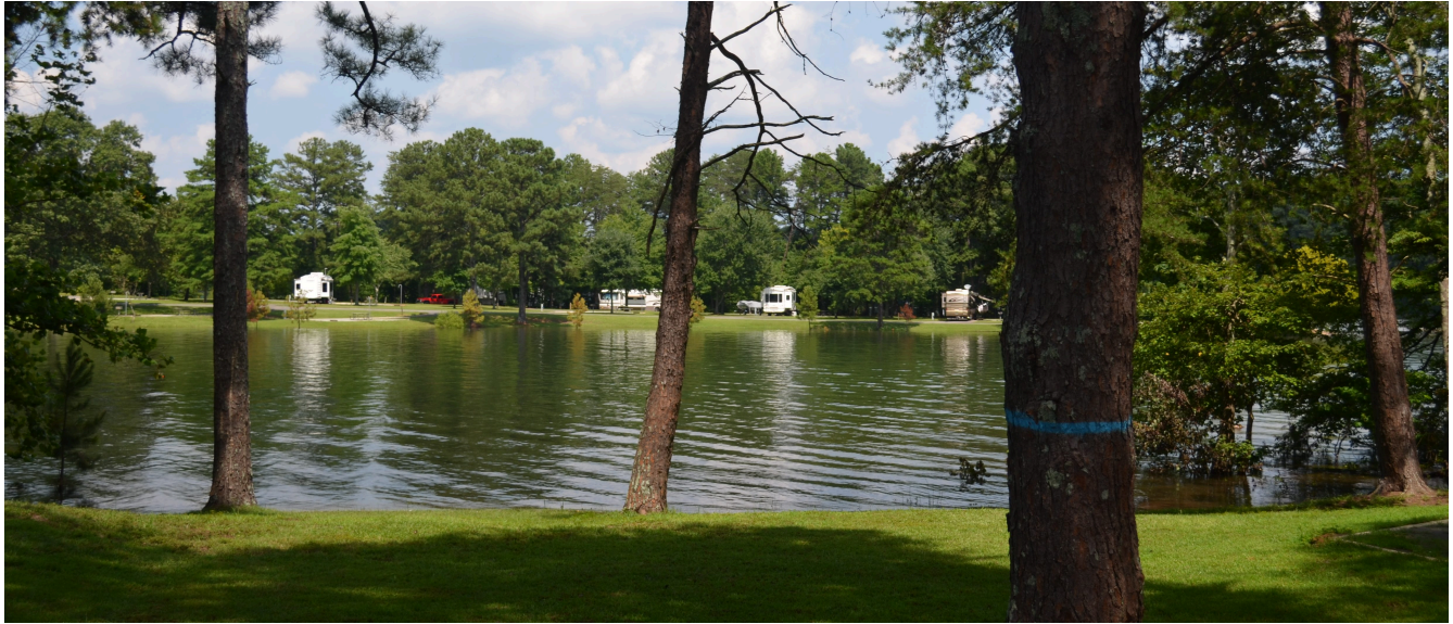
Hiking on Lake Lanier