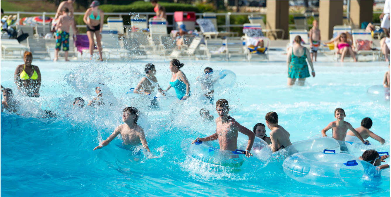
Wave Pool at Margaritaville at Lanier Islands