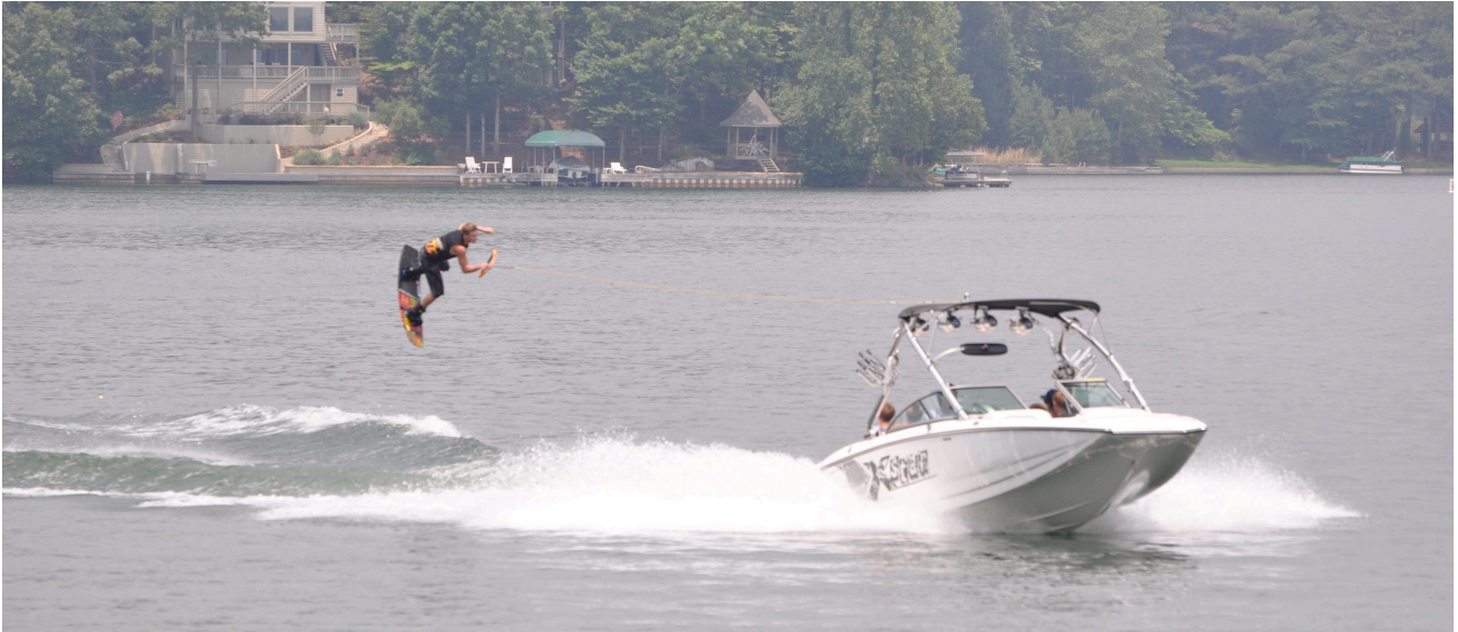
Wake-surfing on Lake Lanier