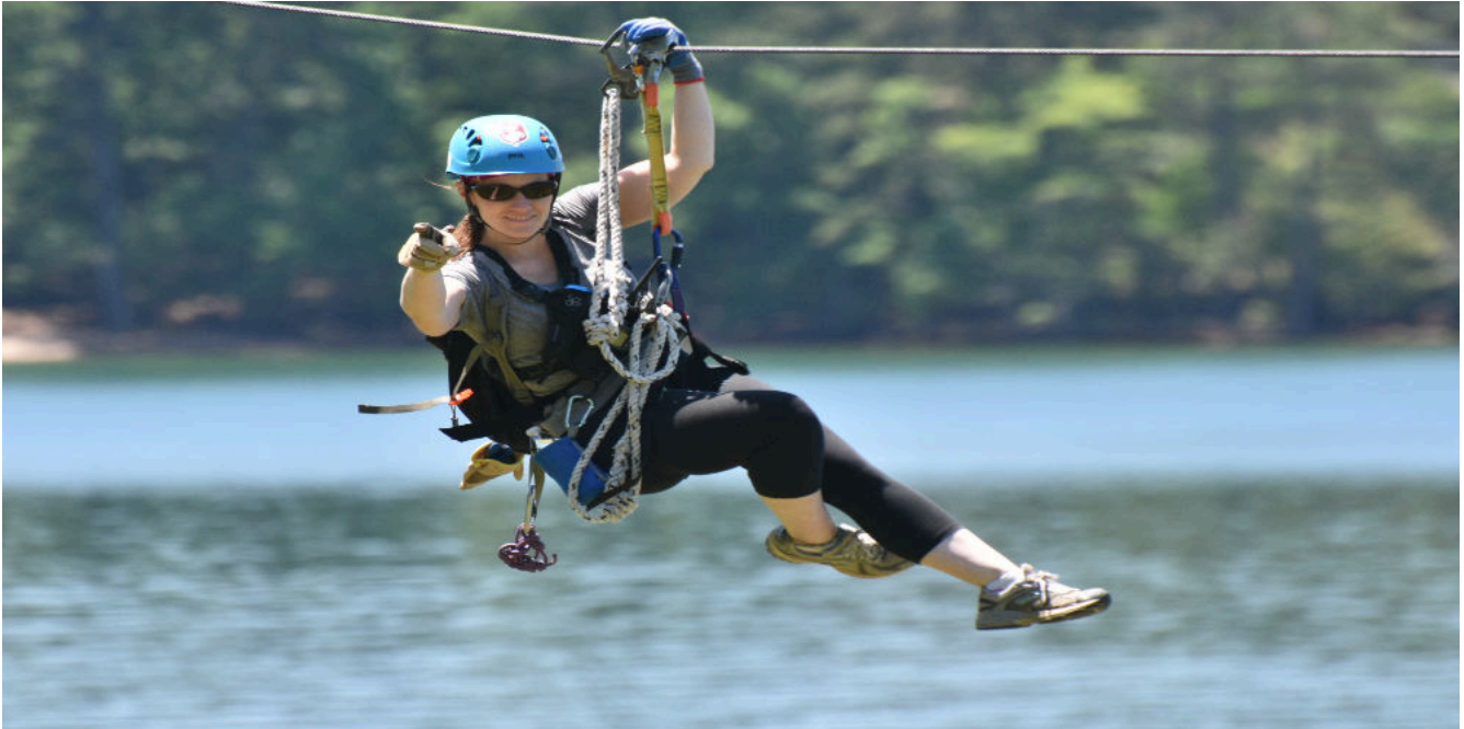
Zipline OVER Lake Lanier at Margaritaville at Lanier Islands Water Park