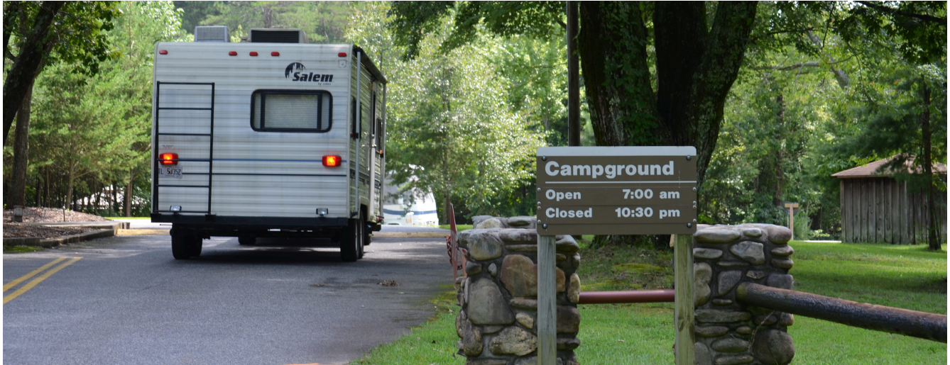
Camping on Lake Lanier