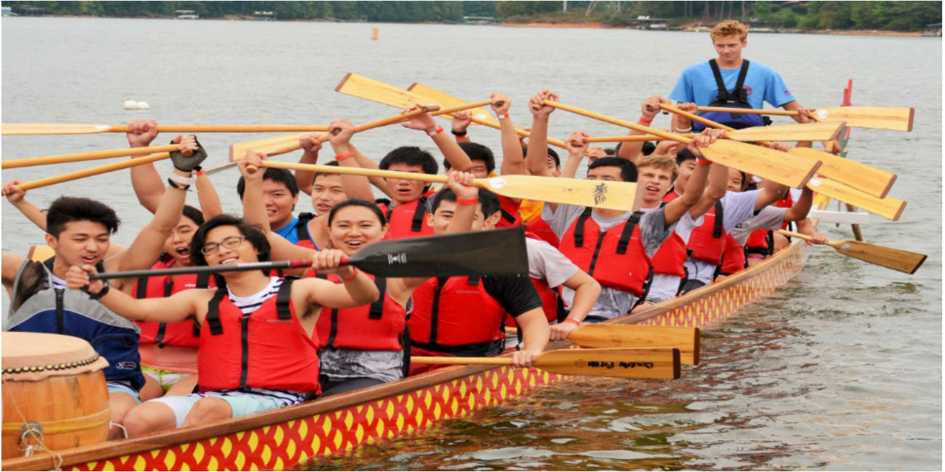
Dragon Boat Festival on Lake Lanier