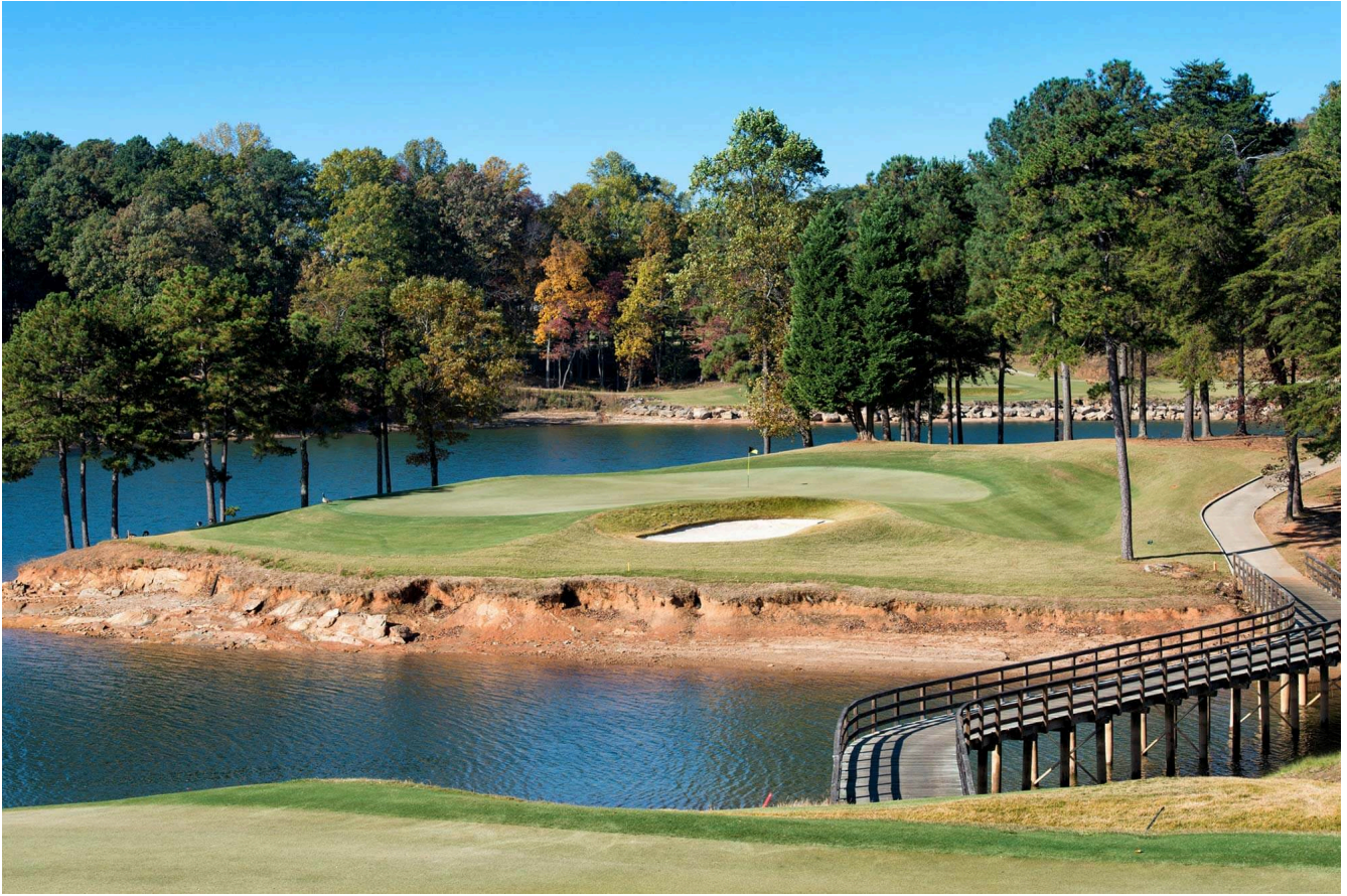
Legacy Golf Course Lake Lanier, photograph LanierIslands.com