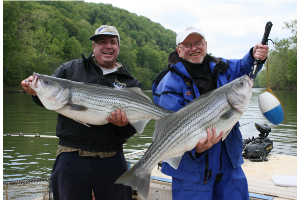
"Big Fish On" Lake Lanier Fishing Guides & Charters