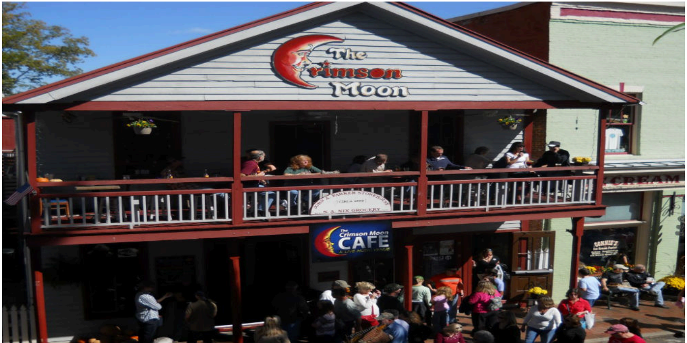
The Crimson Moon in Dahlonega