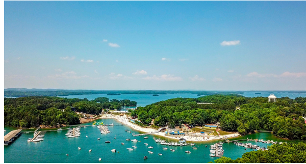
Margaritaville at Lanier Islands

Garden – Gainesville offer numerous points of interest, as well as many great educational events and programs.