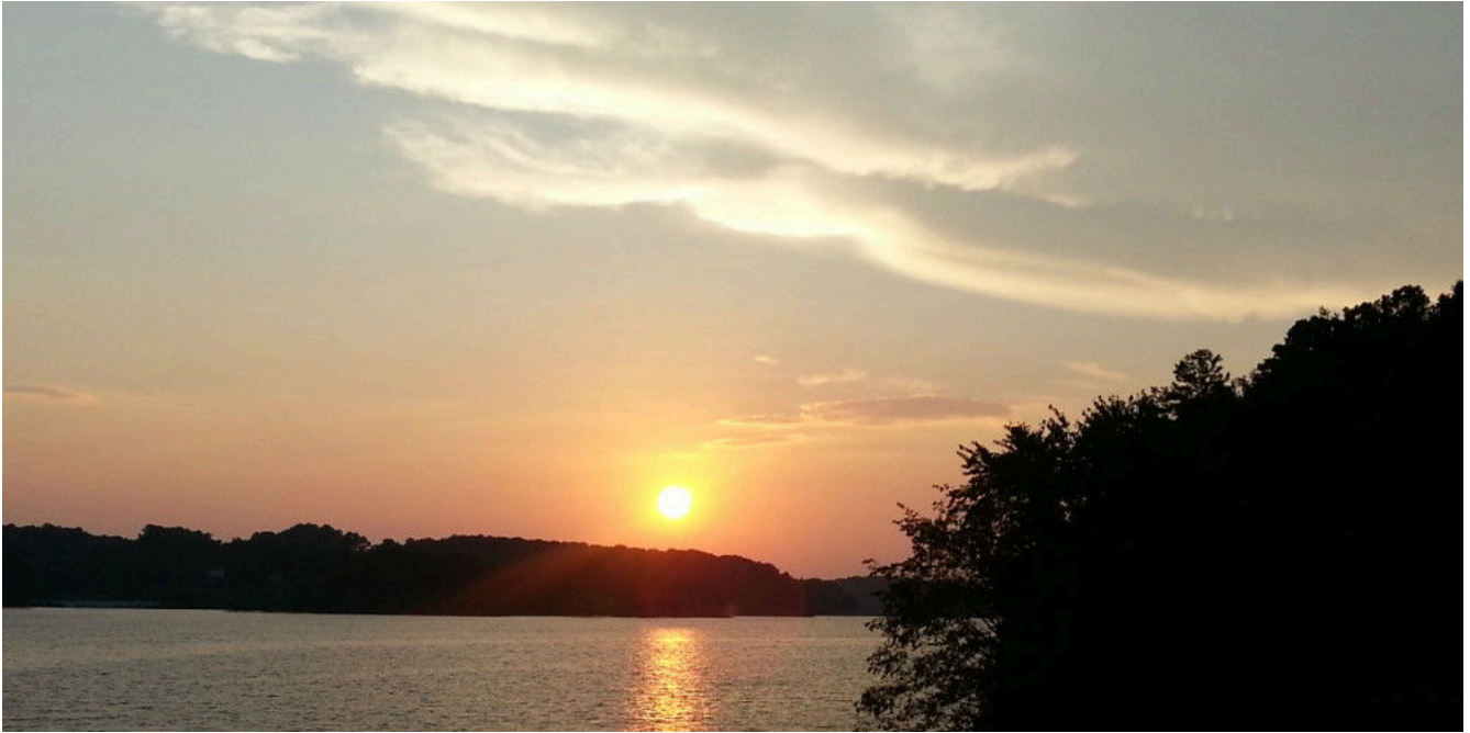
Lake Lanier