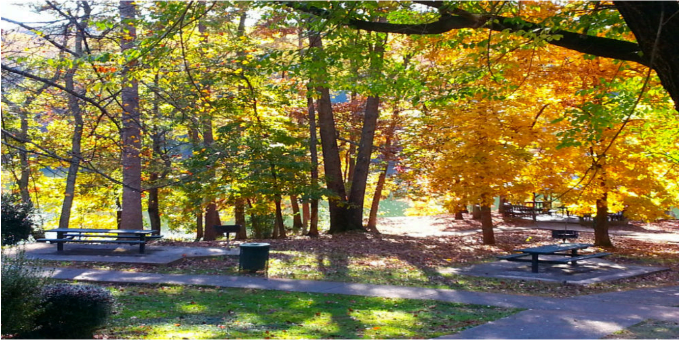
Lake Lanier Park