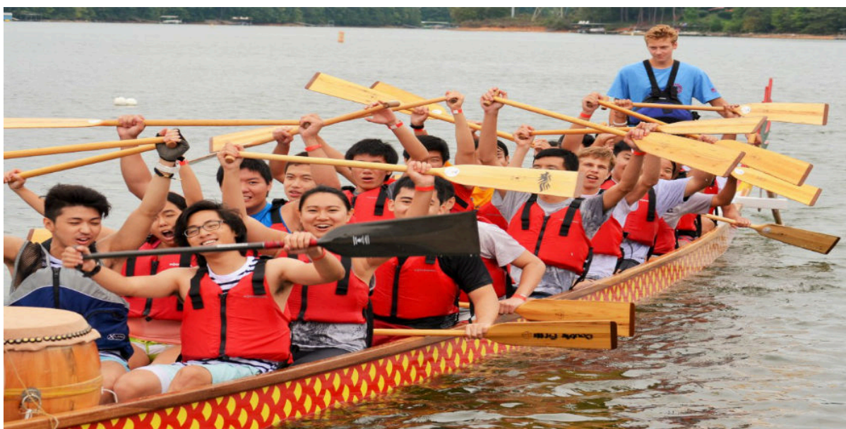
Dragon Boat Festival on Lake Lanier

Go for a nice leisurely paddle or do a long section along the Chattahoochee River. Race or relax. It's your call. Soon you'll understand why folks come from all around the globe for rowing, canoeing and kayaking on Lake Lanier.