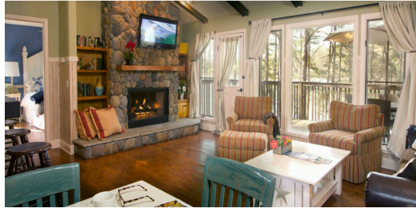
Legacy LakeHouses

Located in a beautifully wooded private setting on the glimmering shores of Lake Sidney Lanier, our LakeHouses at Legacy are relaxing and conveniently designed for families and small groups. Each of these lake cabin and cottage rentals in North Georgia features two private bedrooms, each with its own private bathroom, washer and dryer, kitchen (no oven), dining area, living area with a sleeper sofa, fieldstone gas fireplace, and a wooden deck with gas grill. Each cottage contains 1 king bed, 2 full size beds and 1 sleeper sofa, which will accommodate up to 8 guests. There are 2 assigned parking spaces for each LakeHouse. The LakeHouses at Legacy are pet-friendly. Find out more about LakeHouses at Legacy: http://www.lanierislands.com/accommodations/lakehouses .