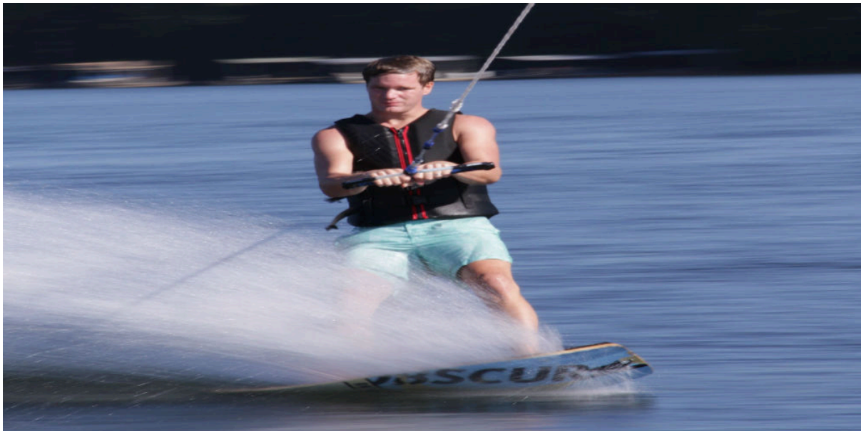
Wakeskating on Lake Lanier

Although some of us prefer watersports that use paddles or oars, others can't have a lake vacation without "having a go" at being pulled by a mighty speed boat, jumping, flipping and dare-deviling amongst the motorcrafts' wakes.