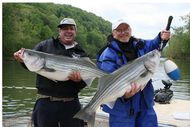
“Big Fish On” Lake Lanier Fishing Guides & Charters, photograph from “Big Fish On”

Your decision of what rod and reel combination to use is primarily based on the size of striper that you are targeting. All reels should have a good drag and