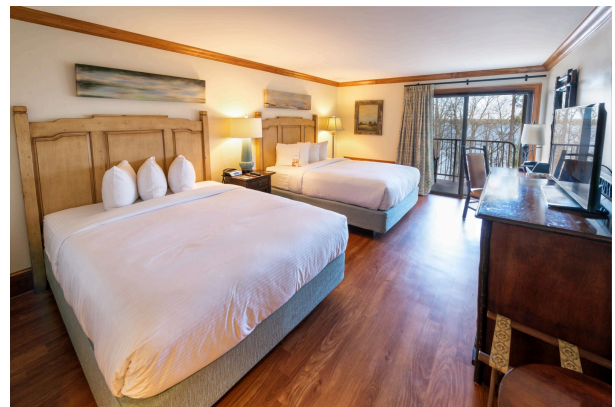
Room at Legacy Lodge at Lanier Islands

At the heart of Lanier Islands, Legacy Lodge & Conference Center offers 216 comfortably furnished guest rooms, consisting of King Rooms, Double Queen Rooms and 4 King Suites. Their rooms offer the finest amenities, including spacious bathtubs and tiled walk-in showers, granite surfaces, balconies or patios, flat-screen televisions, complimentary wireless Internet, as well as concierge and room services. Enjoy the stunning lake view from your room while you rest, before exploring the activities and amenities Lake Lanier Islands has to offer. Legacy Lodge is home to two incredible dining options, 22,000 square feet of flexible meeting space, a rejuvenating spa, a heated outdoor pool, a top-of-line fitness center, gift shop, and a full-service business center. Legacy Lodge is pet-friendly. Find out more about Legacy Lodge: http://www.lanierislands.com/accommodations/lodge .