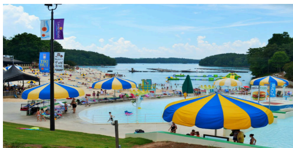
LanierWorld at Lanier Islands

At the Family Fun Park, enjoy Wild Waves, the South's largest wave pool, as well as Raging River, carnival rides and TAD'S Lakeside Grille. A short walk through a cozy tunnel takes you from the Family Fun Park to Big Beach, home of the largest collection of rides, slides and dining options at LanierWorld. Across the sand and over the Boardwalk, lies Sunset Cove, THE spot on Lake Lanier for music, entertainment, dining and nightlife!