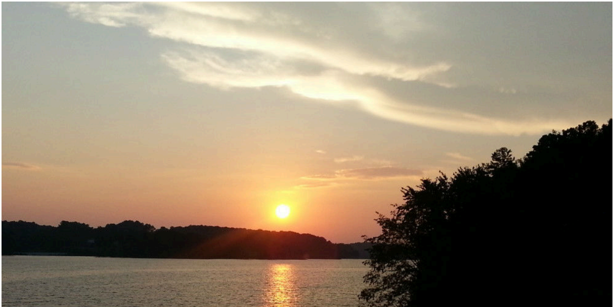
Lake Lanier