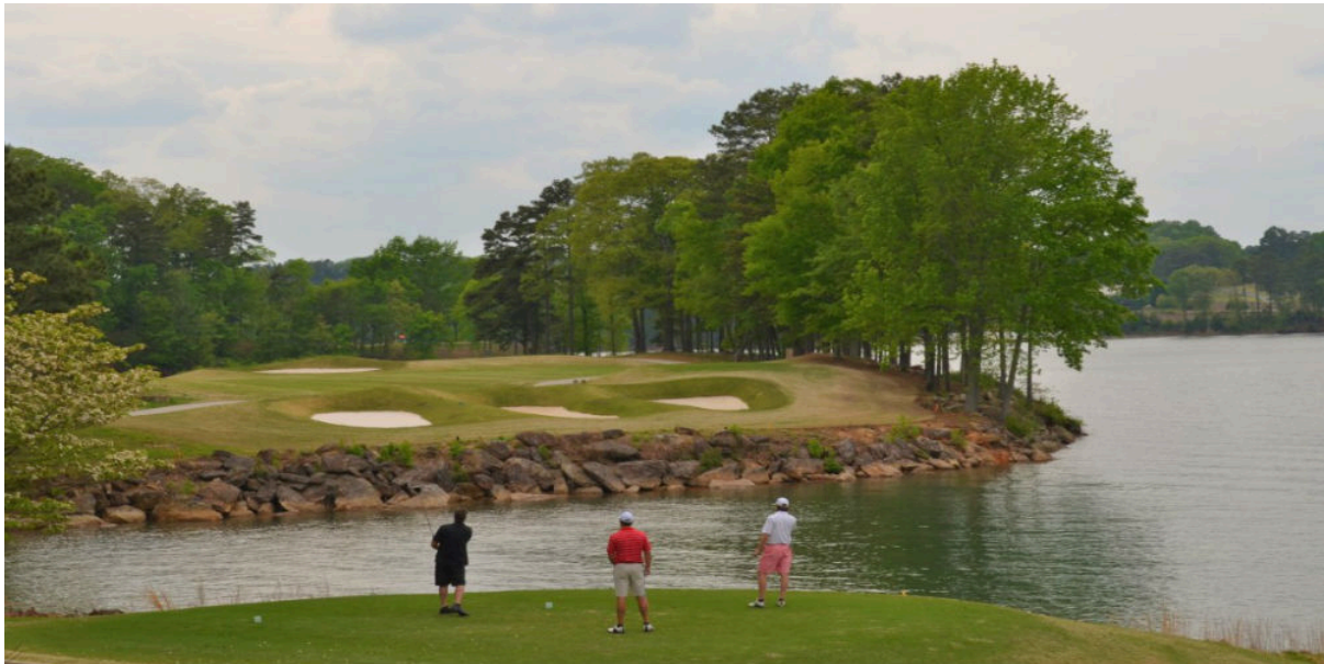
Legacy on Lanier Golf Club at Lake Lanier Islands

Enjoy a round of 18 holes in the beautiful setting of Lake Lanier. In this section, we list the public courses in the Lake Lanier vicinity.