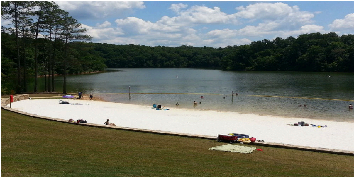
Designated Swim Area at Don Carter State Park, photograph by Robert Sutherland

A refreshing swim in the lake is a great way to complete your day on Lake Lanier. Many of the designated swim areas have inviting beaches. The parks that host them offer various amenities, including picnic pavilions, playgrounds, barbecues and bathrooms. You can easily pass a whole day swimming, picnicking and playing at Lake Lanier's parks.