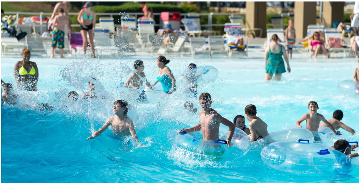
Wave Pool at LanierWorld at Lanier Islands

One thing is certain: you cannot run out of fun things to do to keep everyone happy on your vacation to Lake Lanier