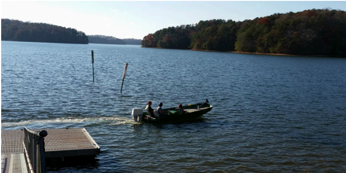
Fishing on Lake Lanier

Lake Lanier is one of America's favorite fishing spots. Finding a spot to launch is never a problem. There is an abundant supply of boat ramps. They're scattered all around the 38,000 acres of our freshwater lake that is filled with hungry fish.