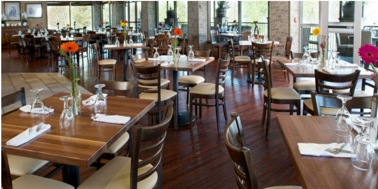
Sidney's Restaurant at Lanier Islands

Taking a break to dine and enjoy a lakeside restaurant will surely be worth the time spent. You'll love our dining establishments on Lake Lanier.