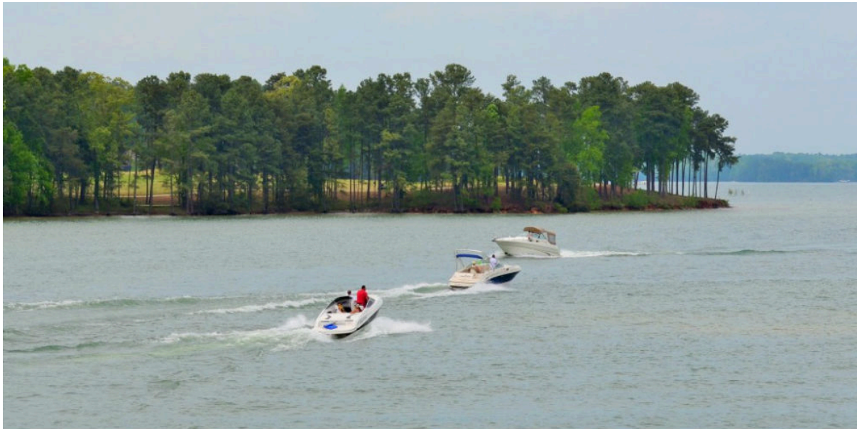
Boats on Lake Lanier

Few recreational activities can top a boat ride on Lake Lanier on almost any day of the year. Getting out at sunrise to fish or to paddle around in a canoe or a kayak is the perfect way to start the day. Blasting around Lanier in a souped-up speedboat on a sunny afternoon is invigorating, especially because there are no speed limits on the lake. Evening rides — puttering around with friends, family and a refreshing beverage — can pacify even the most stressful days.