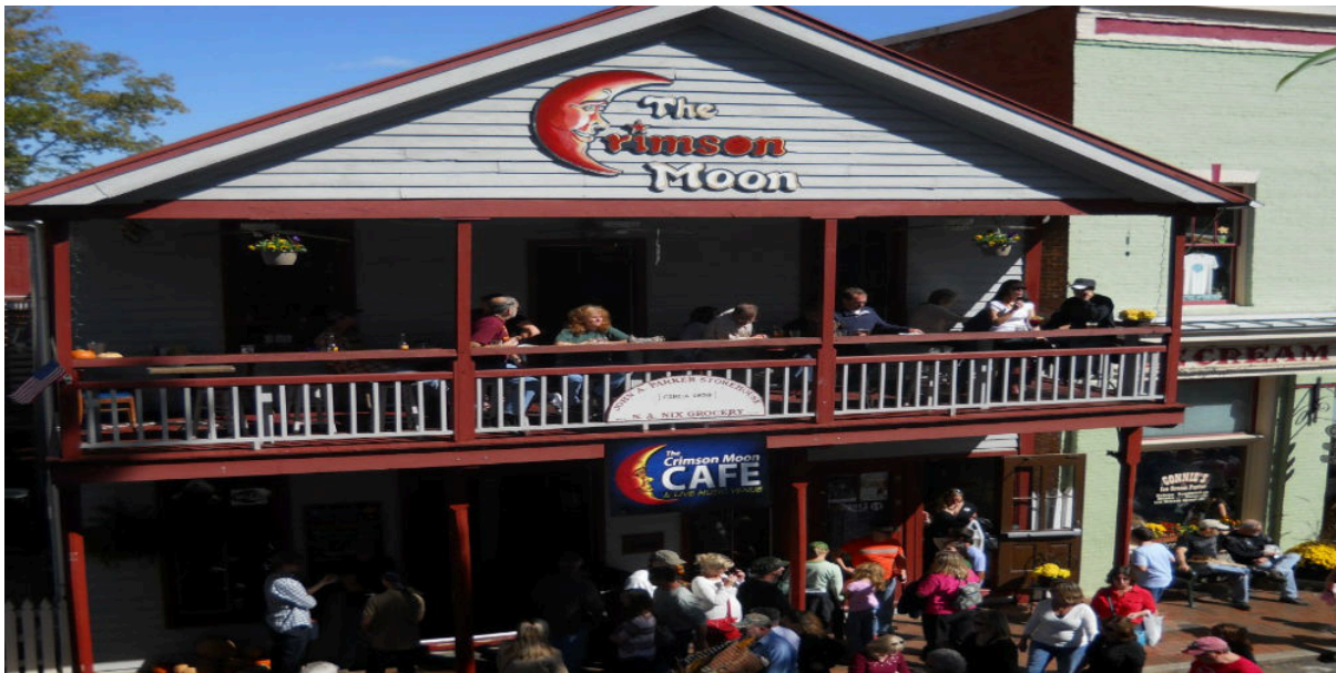
The Crimson Moon in Dahlonega

Lake Lanier is conveniently located. It's a short drive south to Atlanta and a short drive north to the charming North Georgia towns of Dahlonega and Helen.