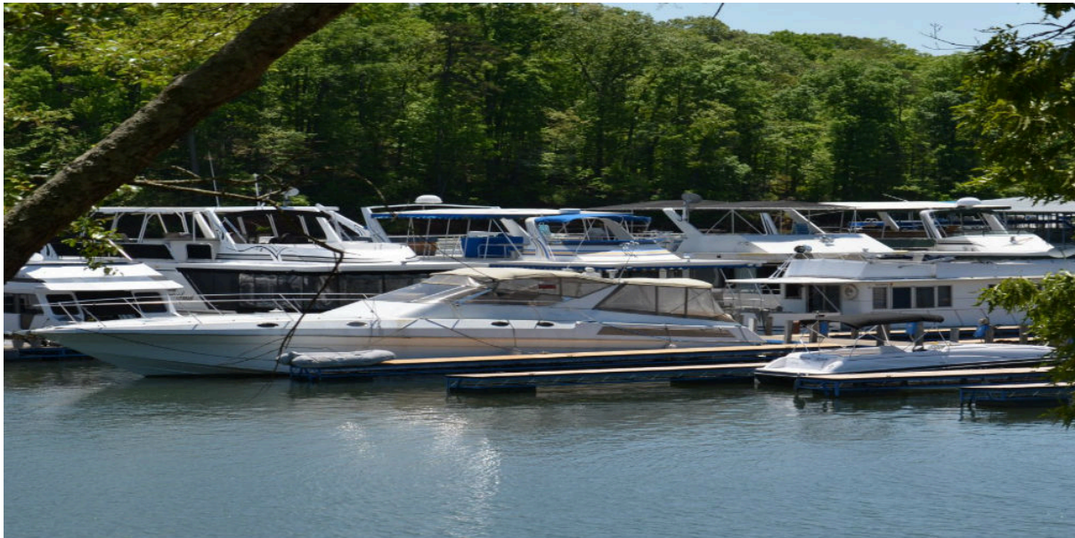
Lake Lanier Marina

From fuel docks to ship stores, marine repair to yacht sales, lakeside dining to boat rentals, Lake Lanier marinas have much more to offer than just boat slips.