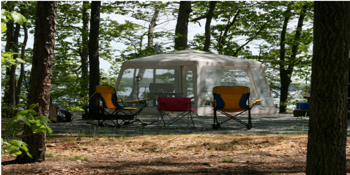
Shady Grove Campground

Camping on Lake Lanier is more than “heaven on earth.” It’s also a bit of heaven on the lovely shores of one of America’s most popular lakes. Lake Lanier is a great place to rest, whether in a cabin, RV or tent.