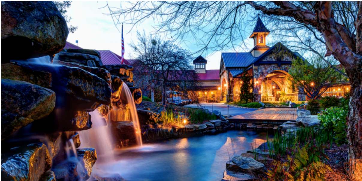
Legacy Lodge at Lanier Islands

Since Lake Lanier spans a wide area, you have many options for where you can base your stay. Choosing where to stay might primarily depend on your budget. However, you'll also need to consider what you want to do and where you want to explore while at the lake.