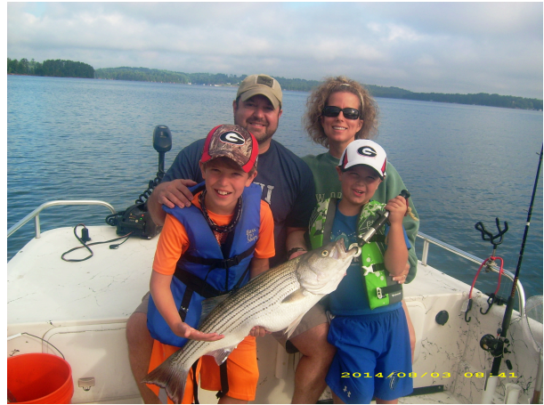
“Big Fish On” Lake Lanier Fishing Charters and Guide, photograph from “Big Fish On”